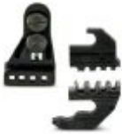
Replacement die, for CRIMPFOX-MT

Replacement die - CRIMPFOX MT 2,5 DIE - 1208050