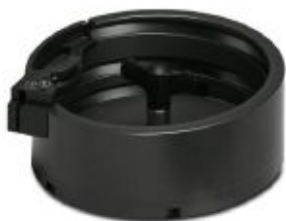
Accessories for CF 1000 stripping and crimping machine, feeder bowl for 0.50 ... 1.5 mm 2 sleeves

Please be informed that the data shown in this PDF Document is generated from our Online Catalog. Please find the complete data in the user's documentation. Our General Terms of Use for Downloads are valid ( http://phoenixcontact.com/download )