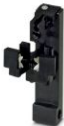
Replacement processing insert 1.5 mm 2 , for the crimping device CF 3000-2,5

Please be informed that the data shown in this PDF Document is generated from our Online Catalog. Please find the complete data in the user's documentation. Our General Terms of Use for Downloads are valid ( http://phoenixcontact.com/download )