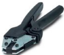
Crimping pliers, for CK 4,0... contacts, for 4.0 - 6.0 mm 2 conductor cross sections

Please be informed that the data shown in this PDF Document is generated from our Online Catalog. Please find the complete data in the user's documentation. Our General Terms of Use for Downloads are valid ( http://phoenixcontact.com/download )