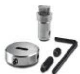
Stamping bit, for elongated holes: 4.5 x 12 mm

Stamping bit - PPS-ST (4,5X12)L - 1203534