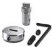
Stamping bit, for elongated holes: 3.5 x 12 mm

Stamping bit - PPS-ST (3,5X12)L - 1203563