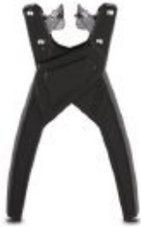
Stripping tool, for conductors and cables of 6.0 to 16.0 mm diameter

Please be informed that the data shown in this PDF Document is generated from our Online Catalog. Please find the complete data in the user's documentation. Our General Terms of Use for Downloads are valid ( http://phoenixcontact.com/download )