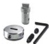
Stamping bit, for elongated holes: 3.5 x 12 mm

Stamping bit - PPS-ST (3,5X12)L - 1203563