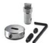
Stamping bit, for elongated holes: 4.5 x 12 mm

Stamping bit - PPS-ST (4,5X12)L - 1203534