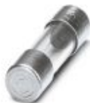
Accessories for crimping machine

Cable-cutting tool - CF-10 FUSE 250V SET - 1207310