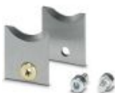
Replacement knife, for the CUTFOX 10 cutting machine

Spare knife - CF-10 CUTTER KNIFE SET - 1207284