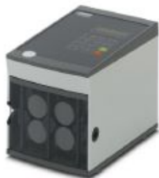
Automatic cutting device for cables, litz wires, and shrink sleeves, for 100 - 240 V mains voltage

Please be informed that the data shown in this PDF Document is generated from our Online Catalog. Please find the complete data in the user's documentation. Our General Terms of Use for Downloads are valid ( http://phoenixcontact.com/download )