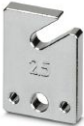
Accessories for CF 1000 stripping and crimping machine, separating plate for 2.5 mm 2 sleeves

Please be informed that the data shown in this PDF Document is generated from our Online Catalog. Please find the complete data in the user's documentation. Our General Terms of Use for Downloads are valid ( http://phoenixcontact.com/download )