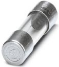
Accessories for CF 1000 stripping and crimping machine, mains fuse, 20 x 5 mm, slow-blow, 2 A, up to 250 V

Please be informed that the data shown in this PDF Document is generated from our Online Catalog. Please find the complete data in the user's documentation. Our General Terms of Use for Downloads are valid ( http://phoenixcontact.com/download )