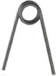
Finger guard, for ZAP 25, ZAP 40, and ZAP 100 crimping pliers

Please be informed that the data shown in this PDF Document is generated from our Online Catalog. Please find the complete data in the user's documentation. Our General Terms of Use for Downloads are valid ( http://phoenixcontact.com/download )