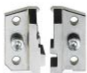
CF 500 die, for plug-in bridges (FBS... 4,5,6 and 8) for easy retrieval of individual jumper bars

Replacement die - CF 500/DIE FBS - 1212461