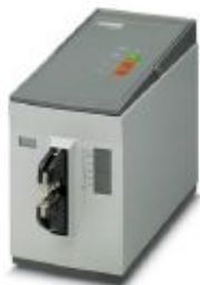
Universal electric crimper to take dies for a wide variety of contact elements

Please be informed that the data shown in this PDF Document is generated from our Online Catalog. Please find the complete data in the user's documentation. Our General Terms of Use for Downloads are valid ( http://phoenixcontact.com/download )