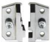
CF 500 die, for plug-in bridges (FBS... 4,5,6 and 8) for easy retrieval of individual jumper bars

Replacement die - CF 500/DIE FBS - 1212461