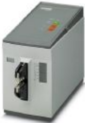
Universal electric crimper to take dies for a wide variety of contact elements

Please be informed that the data shown in this PDF Document is generated from our Online Catalog. Please find the complete data in the user's documentation. Our General Terms of Use for Downloads are valid ( http://phoenixcontact.com/download )