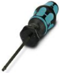
Torque screwdriver, with preset torque of 0.2 Nm and 4 mm hexagonal drive for M8 connectors

Please be informed that the data shown in this PDF Document is generated from our Online Catalog. Please find the complete data in the user's documentation. Our General Terms of Use for Downloads are valid ( http://phoenixcontact.com/download )