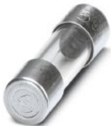
Fuse, slow-blow, 1.25 A, quantity: 2 fuses

Please be informed that the data shown in this PDF Document is generated from our Online Catalog. Please find the complete data in the user's documentation. Our General Terms of Use for Downloads are valid ( http://phoenixcontact.com/download )