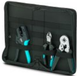
Tool set, equipped

Please be informed that the data shown in this PDF Document is generated from our Online Catalog. Please find the complete data in the user's documentation. Our General Terms of Use for Downloads are valid ( http://phoenixcontact.com/download )