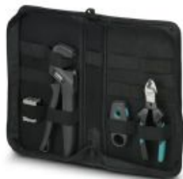
Tool set, equipped

Please be informed that the data shown in this PDF Document is generated from our Online Catalog. Please find the complete data in the user's documentation. Our General Terms of Use for Downloads are valid ( http://phoenixcontact.com/download )