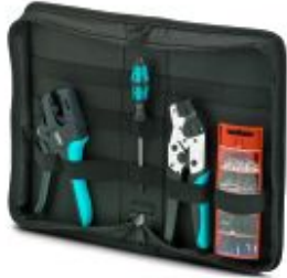
Set for stripping, crimping and screwing, equipped

Please be informed that the data shown in this PDF Document is generated from our Online Catalog. Please find the complete data in the user's documentation. Our General Terms of Use for Downloads are valid ( http://phoenixcontact.com/download )