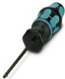
Torque screwdriver, with preset torque of 2.0 Nm and 4 mm hexagonal drive for the pressure nut of the fast connection

Please be informed that the data shown in this PDF Document is generated from our Online Catalog. Please find the complete data in the user's documentation. Our General Terms of Use for Downloads are valid ( http://phoenixcontact.com/download )