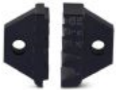
Spare die for CRIMPFOX 6

Replacement die - CRIMPFOX 6/DIE - 1212035