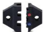
Spare die for CRIMPFOX-RCI 2,5

Replacement die - CRIMPFOX-RCI 2,5/DIE - 1212054