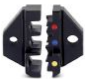
Spare die for CRIMPFOX-RCI 6-1

Replacement die - CRIMPFOX-RCI 6-1/DIE - 1212290