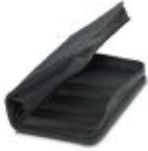
Tool box, unequipped

Tool bag, unequipped - TOOL-KIT STANDARD EMPTY - 1212423