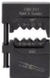
Die, for Crimpfox-M, for turned contacts 0.5 ... 4 mm 2 , packed in a serial storage box

Please be informed that the data shown in this PDF Document is generated from our Online Catalog. Please find the complete data in the user's documentation. Our General Terms of Use for Downloads are valid ( http://phoenixcontact.com/download )