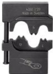
Die, for Crimpfox-M, for non-insulated cable lugs 4 - 10 mm 2 , packed in a serial storage box

Please be informed that the data shown in this PDF Document is generated from our Online Catalog. Please find the complete data in the user's documentation. Our General Terms of Use for Downloads are valid ( http://phoenixcontact.com/download )