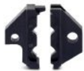
Spare die for CRIMPFOX-TC 10

Replacement die - CRIMPFOX-TC 10/DIE - 1212296