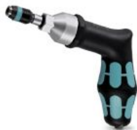
Torque screw driver, accuracy as per EN ISO 6789 standard, adjustable from 3 - 6 Nm

Please be informed that the data shown in this PDF Document is generated from our Online Catalog. Please find the complete data in the user's documentation. Our General Terms of Use for Downloads are valid ( http://phoenixcontact.com/download )