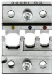
Die for crimping machine CF 500, for insulated cable lugs (C ... RCI... and C ... FCI...) 0.5 ... 6 mm 2

Please be informed that the data shown in this PDF Document is generated from our Online Catalog. Please find the complete data in the user's documentation. Our General Terms of Use for Downloads are valid ( http://phoenixcontact.com/download )