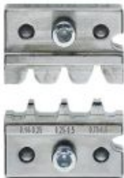
Die for crimping machine CF 500, for slip-on sleeves and flat connectors (C-SCF... and C-SCM...) 0.1 ... 1.5 mm 2

Please be informed that the data shown in this PDF Document is generated from our Online Catalog. Please find the complete data in the user's documentation. Our General Terms of Use for Downloads are valid ( http://phoenixcontact.com/download )