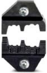
Die for crimping machine CF 500, for ferrules (A... and AI...) 35 and 50 mm 2

Please be informed that the data shown in this PDF Document is generated from our Online Catalog. Please find the complete data in the user's documentation. Our General Terms of Use for Downloads are valid ( http://phoenixcontact.com/download )