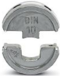
Die (pair), for CRIMPFOX-C50, for insulated ring cable lug 10 mm 2 , oval crimp

Please be informed that the data shown in this PDF Document is generated from our Online Catalog. Please find the complete data in the user's documentation. Our General Terms of Use for Downloads are valid ( http://phoenixcontact.com/download )