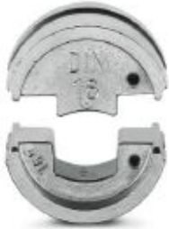
Die (pair), for CRIMPFOX-C50, for insulated ring cable lug 16 mm 2 , oval crimp

Please be informed that the data shown in this PDF Document is generated from our Online Catalog. Please find the complete data in the user's documentation. Our General Terms of Use for Downloads are valid ( http://phoenixcontact.com/download )