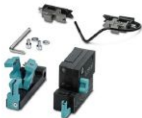
Extension kit, complete, for CF 3000, for taped insulated ferrules, 0.25/0.34 mm 2 , sleeve length 8 mm

Please be informed that the data shown in this PDF Document is generated from our Online Catalog. Please find the complete data in the user's documentation. Our General Terms of Use for Downloads are valid ( http://phoenixcontact.com/download )