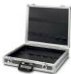
Toolbox, without instruments, with rubber straps as tool fixtures

Crimping pliers - CRIMPFOX 10S - 1212045