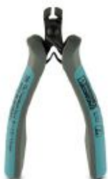
ESD electronic front cutter, without chamfer, with opening spring

Please be informed that the data shown in this PDF Document is generated from our Online Catalog. Please find the complete data in the user's documentation. Our General Terms of Use for Downloads are valid ( http://phoenixcontact.com/download )