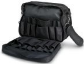
Tool bag, with document and laptop compartments, unequipped

Please be informed that the data shown in this PDF Document is generated from our Online Catalog. Please find the complete data in the user's documentation. Our General Terms of Use for Downloads are valid ( http://phoenixcontact.com/download )