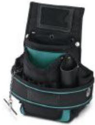
Tool waist bag, unequipped

Please be informed that the data shown in this PDF Document is generated from our Online Catalog. Please find the complete data in the user's documentation. Our General Terms of Use for Downloads are valid ( http://phoenixcontact.com/download )