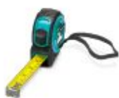
Measuring tape with automatic tape feed and locking mechanism, measuring rail: imperial/metric, length: 5 m

Measuring instrument - MEASURING TAPE 5M I/M - 1200304