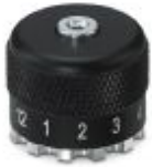
Locator for CRIMPFOX-TC MP6

Spare locator - CRIMPFOX-TC MP LOC - 1045123