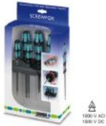
Screwdriver set, bladed/crosshead Phillips Recess ® , VDE insulated, 6-part, incl. rack

Please be informed that the data shown in this PDF Document is generated from our Online Catalog. Please find the complete data in the user's documentation. Our General Terms of Use for Downloads are valid ( http://phoenixcontact.com/download )