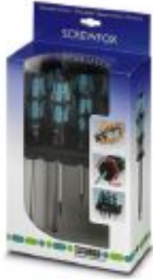
Screwdriver set, bladed/crosshead Phillips Recess ® , 6-part, incl. rack

Please be informed that the data shown in this PDF Document is generated from our Online Catalog. Please find the complete data in the user's documentation. Our General Terms of Use for Downloads are valid ( http://phoenixcontact.com/download )