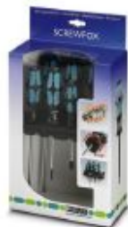
Screwdriver set, bladed/crosshead Pozidriv ® , 6-part, incl. rack

Please be informed that the data shown in this PDF Document is generated from our Online Catalog. Please find the complete data in the user's documentation. Our General Terms of Use for Downloads are valid ( http://phoenixcontact.com/download )