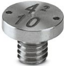
Accessories for CF 1000-1,5 stripping and crimping device up to serial number 160591, sleeve stop for 4.0 mm 2 sleeves and 10 mm sleeve length

Please be informed that the data shown in this PDF Document is generated from our Online Catalog. Please find the complete data in the user's documentation. Our General Terms of Use for Downloads are valid ( http://phoenixcontact.com/download )