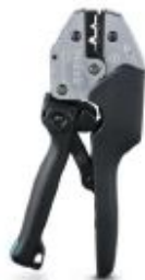
Crimping pliers, for uninsulated cable lugs, 0.34 ... 4 mm 2 , indent crimp

Please be informed that the data shown in this PDF Document is generated from our Online Catalog. Please find the complete data in the user's documentation. Our General Terms of Use for Downloads are valid ( http://phoenixcontact.com/download )