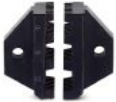
Spare die for CRIMPFOX 25R

Replacement die - CRIMPFOX 25R/DIE - 1212040