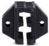
Spare die, for CRIMPFOX 50R

Replacement die - CRIMPFOX 50R/DIE - 1212042