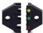
Spare die for CRIMPFOX-RCI 1

Replacement die - CRIMPFOX-RCI 1/DIE - 1212056