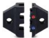
Spare die for CRIMPFOX-RCI 2,5

Replacement die - CRIMPFOX-RCI 2,5/DIE - 1212054