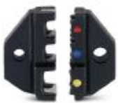
Spare die for CRIMPFOX-RCI 6

Replacement die - CRIMPFOX-RCI 6/DIE - 1212058