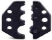
Spare die for CRIMPFOX-RC 10

Replacement die - CRIMPFOX-RC 10/DIE - 1212062